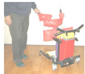
The main body